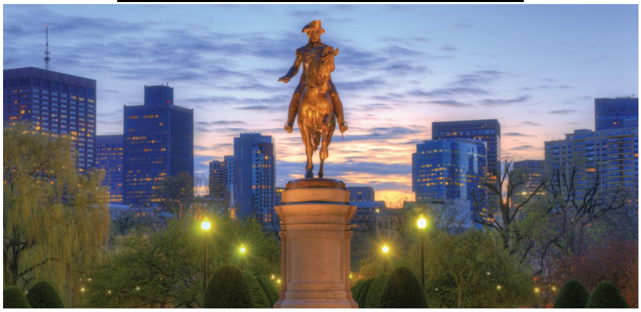
Please click on your desired destination for more information