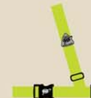
VIEW FROM FRONT

The belt and badge are the official uniform of the AAA School Safety Patrol™. AAA Central Penn distributes these materials to all schools in the AAA Central Penn territory FREE OF CHARGE .