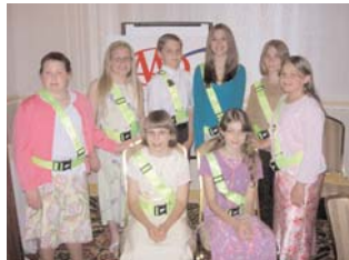
The 2005 Safety Patrol Hall of Fame Inductees May 21, 2005

AAA Central Penn is proud of ALL Safety Patrollers in Adams, Dauphin, Cumberland, Huntingdon, Juniata, Lancaster, Lebanon, Mifflin and Perry Counties. KEEP UP THE GOOD WORK EVERYONE!